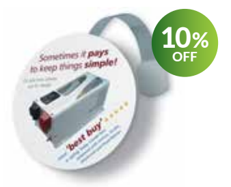
500 from £ 191.00 £213.30 WOBA7S