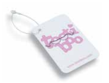
SWING 500 from £63.90 swicc