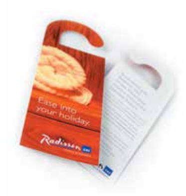
SILK DOOR 250 from £104.40 DOORSK?