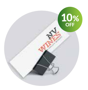
LUXURY NANO CARDS