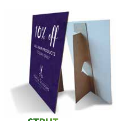
STRUT from £2.27 each IGSCA6